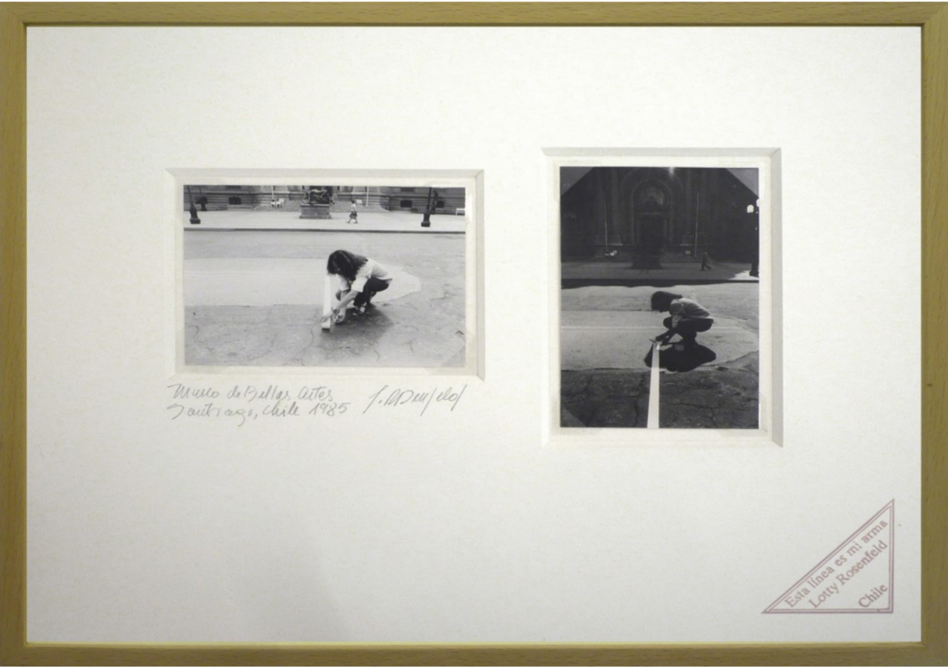
Lotty Rosenfeld Museo de Bellas Artes, 1985 espaivisor - Galería Visor