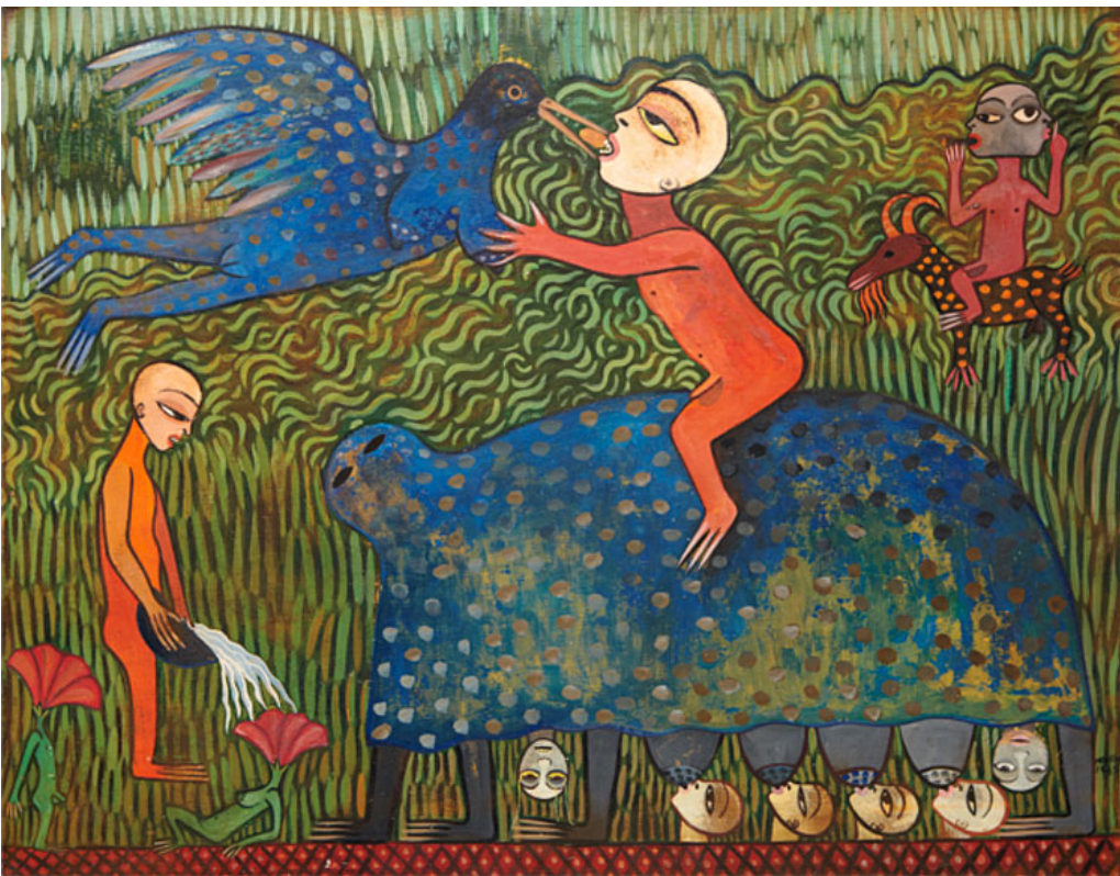
MANUEL MENDIVE. El ave , 1985.

Artists such as Lygia Clark , Hélio Oiticica , Sergio Camargo , Jesús Rafael Soto , Nelson Leirner , Guillermo Kuitca , Gabriel Orozco , Mira Schendel and Francis Alÿs , were the stars of the exhibition. As a novelty, the auction house included its first independent section of Contemporary Cuban Art, represented by Carlos Garaicoa , Manuel Mendive , René Peña , Belkis Ayon and Tania Bruguera , among others.